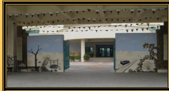
One of the Host Schools

Teams check out from hotel and depart Doha