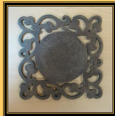
Artwork in Schools