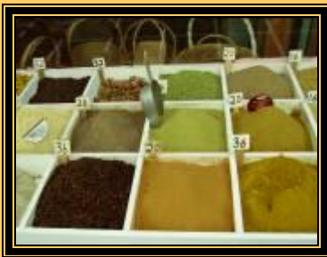
Spices at Souq Waqif

Many of you have asked what happens when the plane lands. Go through Immigration, not the GCC line, with your Visa and Passport. Once your luggage has been collected, walk through the double doors and look for the Marriott stand or the person holding the sign with your country's name on it. The Marriott provides your transportation to and from the airport. Do not walk out of the airport without finding the Marriott representative. Like all airports, it is very hard to get back into the arrival area once you have left.