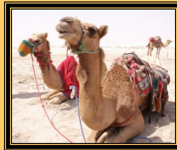
Transportation to and from the airport- Just Kidding!